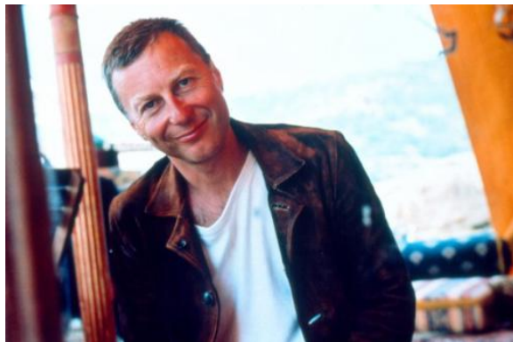
Filmmaker and commercial director Milcho Manchevski.

Though he has made just three feature films (including "Dust" in 2001), with an interval of roughly seven years between films Milcho Manchevski has a very good reason as to why more features aren't on his resume. "I handcraft the films," he said. "And I don't know if it's good or bad. It has its plusses and its minuses," said the director, who mentioned that just the physical work on a film takes a year to two years of his life. "I don't like doing industrial films. I don't like just rushing them through the assembly line and then into the theater and then out. I believe that by investing a piece of yourself in the work in general that will somehow resonate from the screen and stay with the viewer." The director finances all of his films in Europe even though he lives in the Big Apple. He mentioned that "Europe is a funny place for financing films", citing the balance between "half-distributor, half refugee", although in Europe "there is much more of a respect for the author." Still, he noted that "Europe is slowly becoming a little more Hollywood-ized." Mr. Manchevski lamented the Hollywood way, saying that "granted there are films that you need this kind of industrial approach but there are also films that are created by one or two or several filmmakers expressing a particular point of view that get ruined by the money, the suits, the studios or the producers changing, tinkering with the films too much."